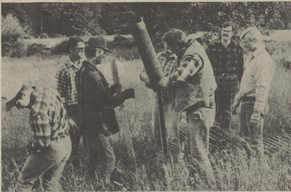
WORK COMPETITION —Putting up snow fences as they get the Fall Fair Grounds ready for this year's event are members of the Back Mountain Service Clubs who competed against one another in getting the work done.