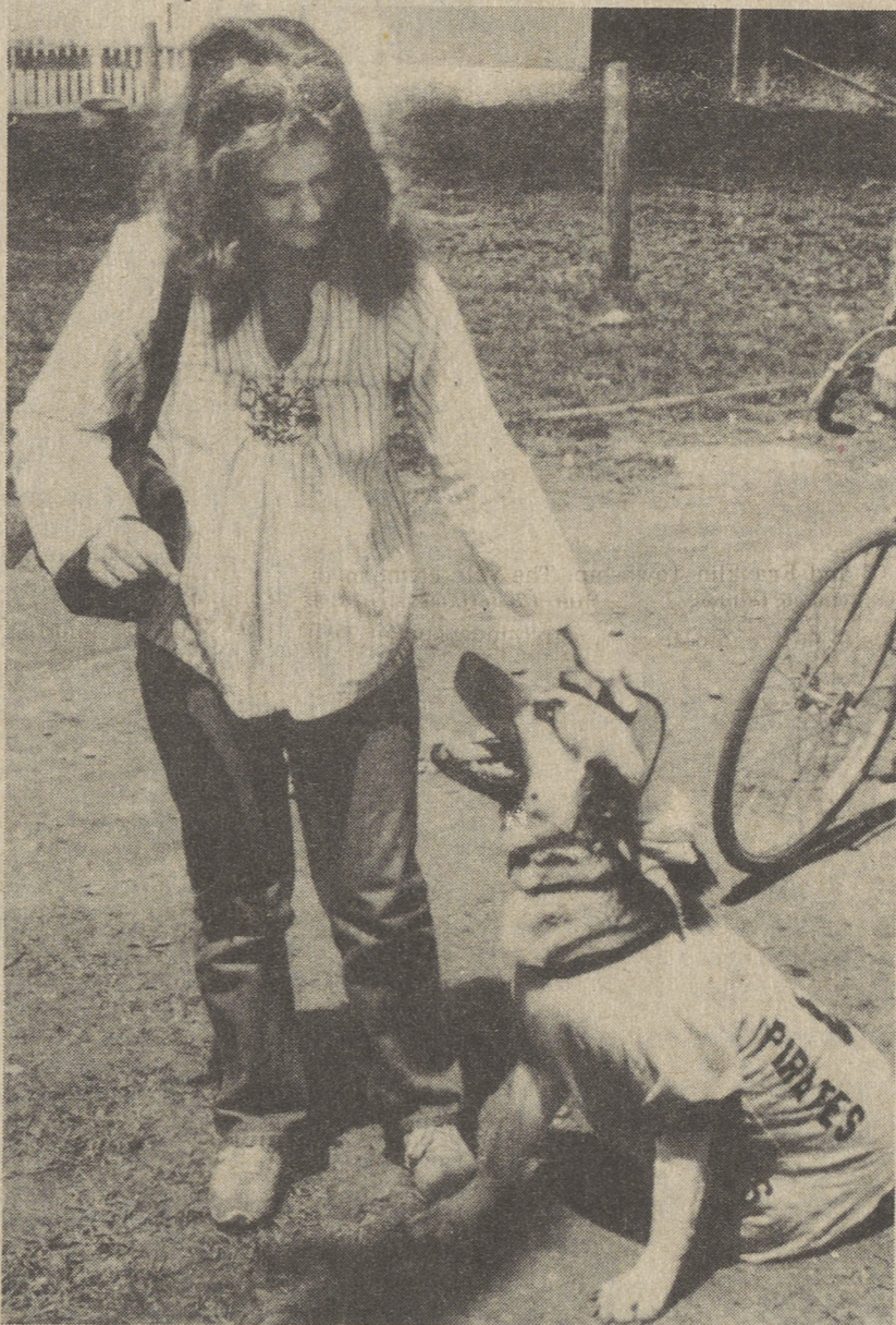
PIRATES MASCOTS—The Pirates team of the Harveys Lake Little League has its own mascot, who will be in attendance at the games cheering on his teammates. Well, barking them on anyway. Above, his owner explains his role in the game to the mascot.