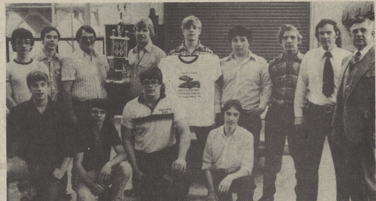
SHOW WINNERS--Members of Dallas Senior High School power technology class took second place with the custom-designed and built motorcycle they entered in the International Championship Auto Show, March 28, 29, 30, at the Philadelphia Civic Center. The class competed against other entries from as far as Florida and Tennessee. First place was won by an $18,000 show bike from Tennessee. The students ended the year with two first