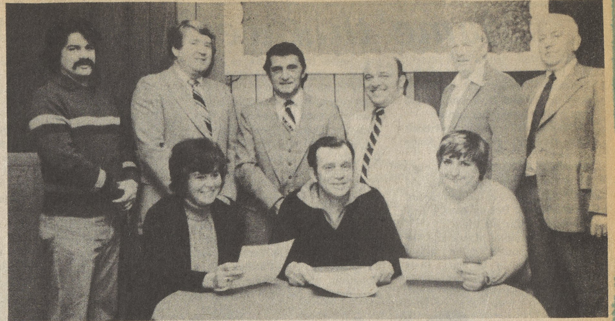
IRISH GAMES--Pictured above are members of the Irish Heritage Games Committee Meeting at their organizational meeting discussing initial plans for the Second Annual Irish Heritage Games which will take place Saturday and Sunday, June 28th and 29th. The highlight of the event will be a 14.7 Kilometer Run around Harveys Lake and the run is expected to attract well over 700 runners. Immediately after the conclusion of the 14.7 run, prizes and awards will be given at a family outing which will be held at Hanson's Amusement Park at

HONDA NORTHEAST Rt. 6 Scranton Phone 383-0944