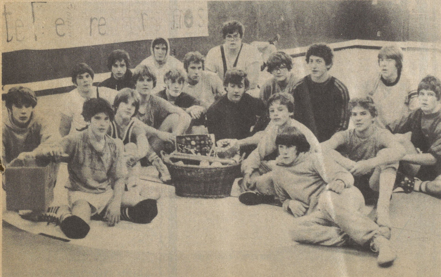
FUNDS FOR AWARDS—Dallas Mountaineer wrestlers are shown with the basket of food which was recently awarded as first prize in