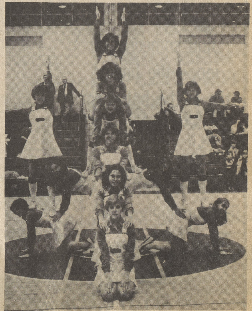
VARSITY CHEERLEADERS—Dallas varsity cheerleaders won seven awards at the Pocono Cheerleaders Camp then placed fourth in the CYC competition. There was only a five-point spread between first and fourth place in the CYC contest. Judges were impressed by the girls' spirit, appearance and gymnastic ability.

The three judges were professional cheerleading judges from Philadelphia, one of them the coach for the Philadelphia Eagles cheerleaders.