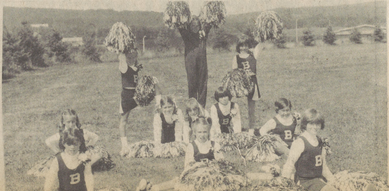
Kingston Township Bobcats (B) Cheerleaders