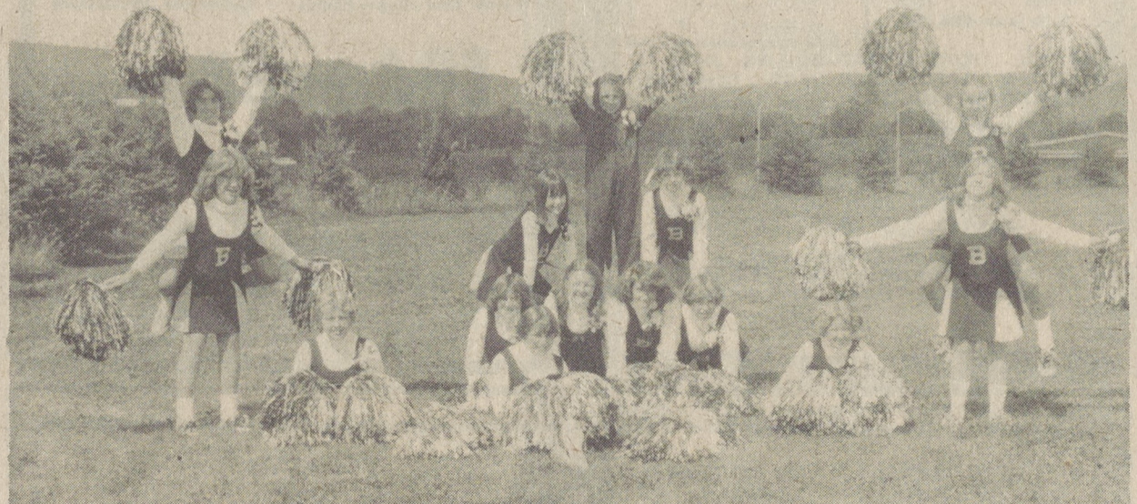
Kingston Township Bobcats (A) Cheerleaders