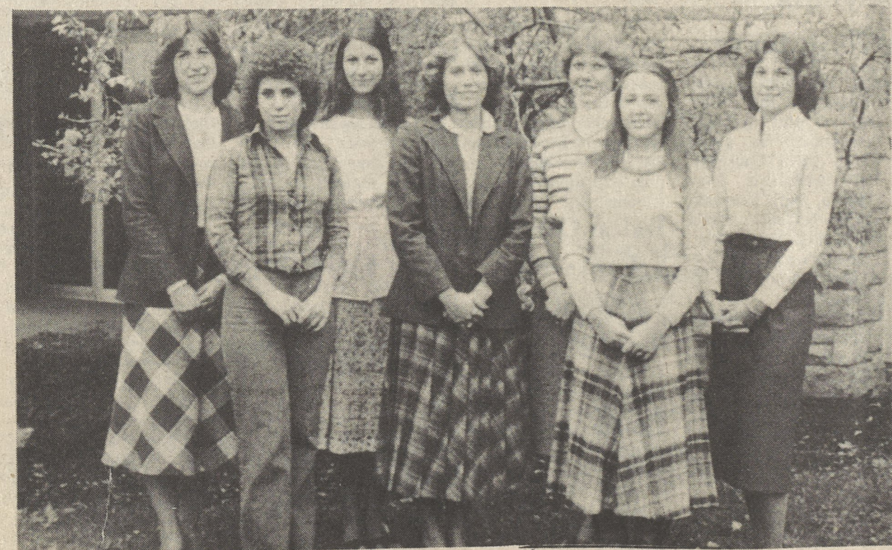
DALLAS HOMECOMING --Seven Dallas High School seniors are candidates for Homecoming Queen activities this year. The activities will begin with the Dallas-Meyers football game this Saturday when the queen will be crowned at halftime. A dance will follow that evening

with Valley West last Saturday night.