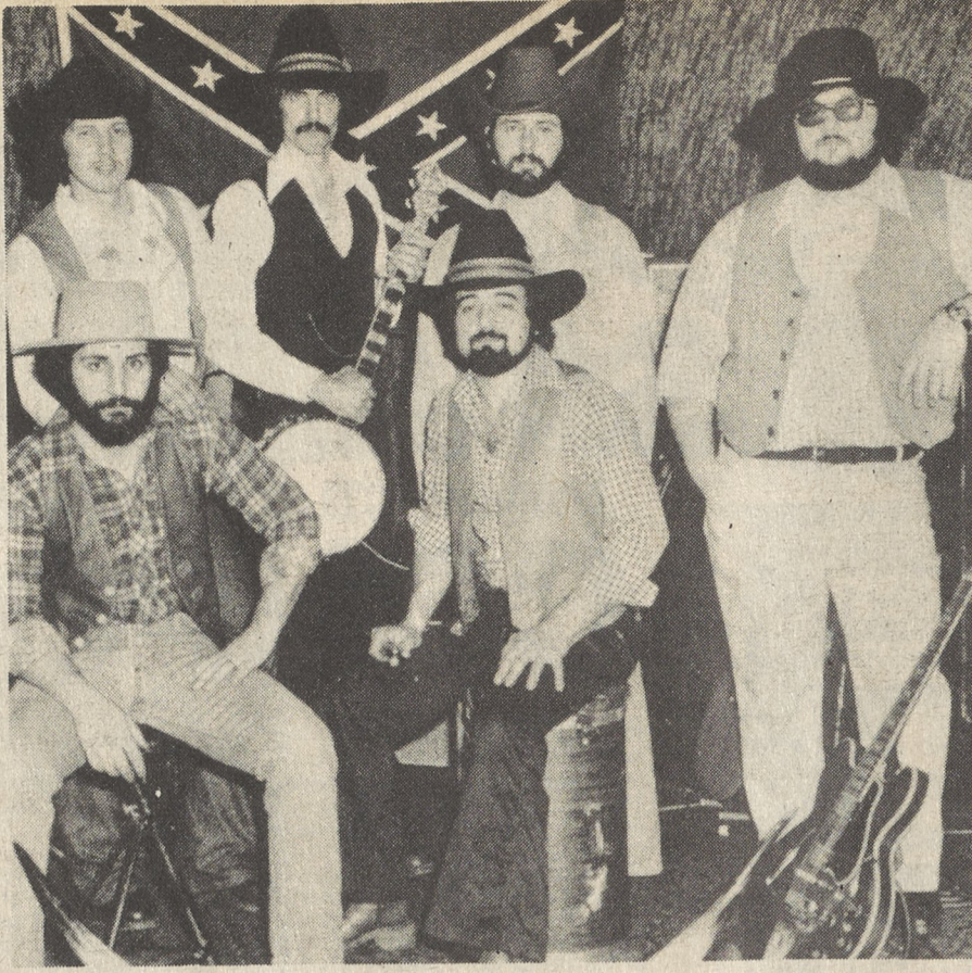
ABILENE —Abilene, one of the best bands in Northeastern Pennsylvania will be on stage Sunday, Sept. 2, 7 to 11 p.m., at the Dallas Firemen's Country Carnival over Labor Day weekend at the Back Mountain Library Auction Grounds, Main Street, Dallas.

Abilene, one of the best bands in Northeastern Pennsylvania, will play Sunday, Sept. 2, from 7 to 11 p.m.