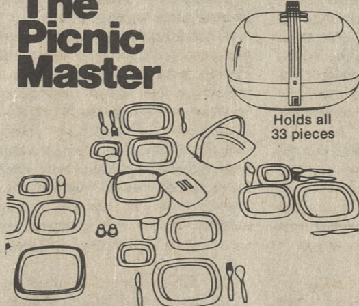
Holds all 33 pieces