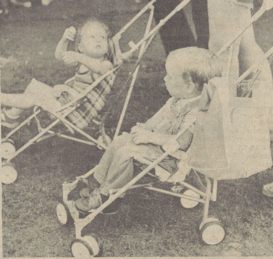
TALKING IT OVER--These two young citizens talk it over--the fun at the firemen's festival at Harveys Lake last week--while their parents carry on a conversation with friends.