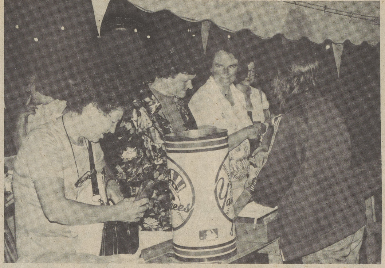
DRAWING--Members of the Harveys Lake Fire Company Auxiliary get ready to draw the lucky numbers for