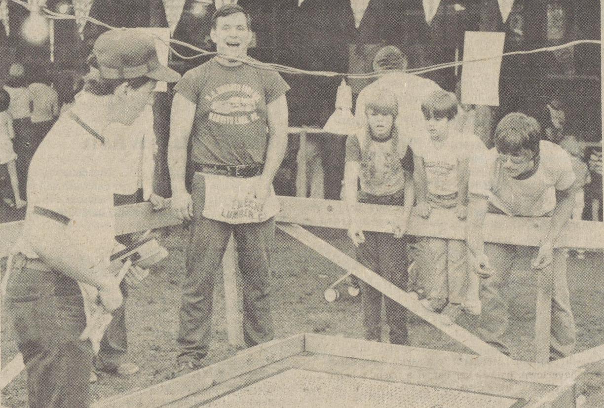
PITCHING COINS--These three youngsters try their turn at winning by pitching coins in the right spot in the coin pitching game at the Harveys Lake Firemen's Festival last week.