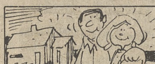
About 63 percent of all American families own their own homes.

The bride's father was employed by Dallas Dairy prior to his retirement in 1972. The groom's father was president and chief executive officer of the Amstar Corporation, manufacturers of Domino Sugar.