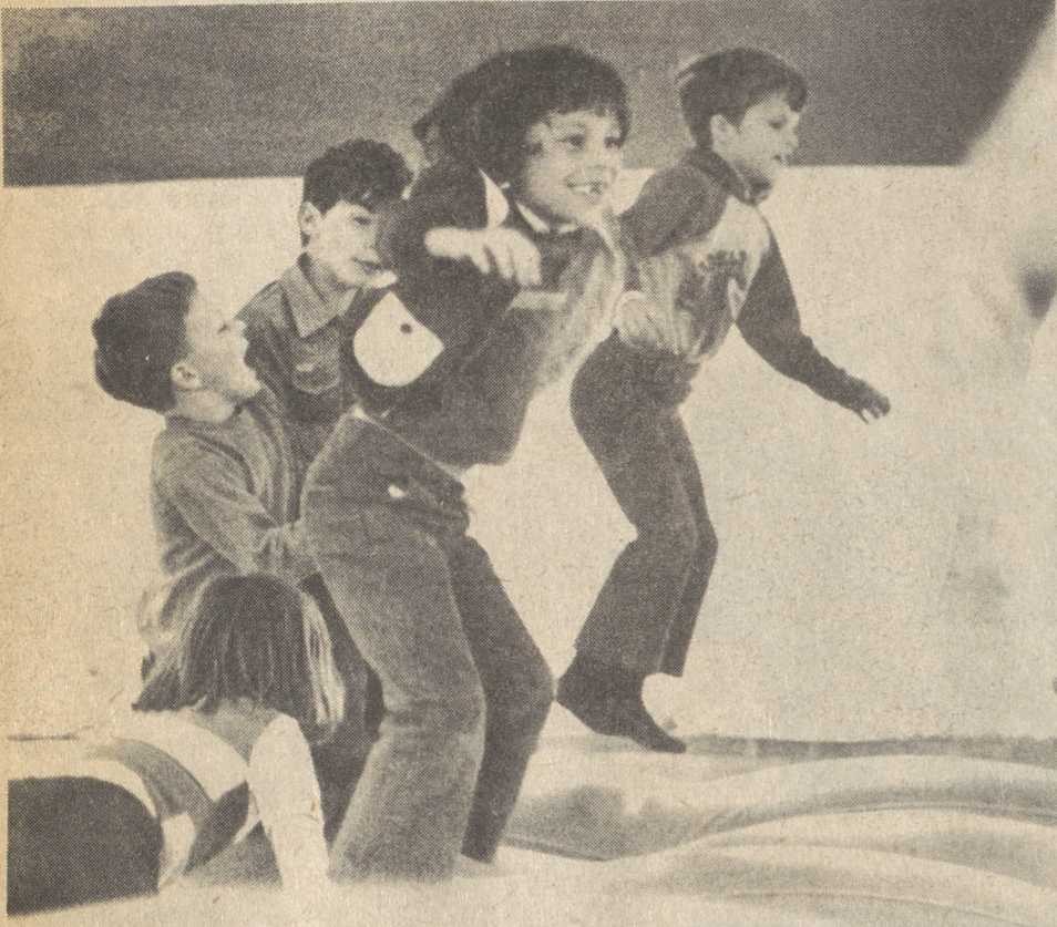
HAVING FUN -Lake Elementary students spent four hours enjoying the amusements at Hanson's Park last week. These youngsters had a ball bouncing up and down in the fun house.