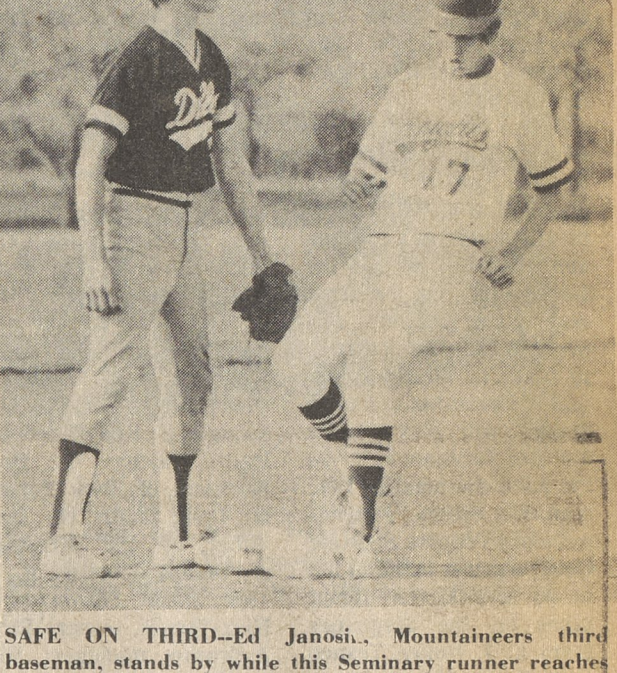
baseman, stands by while this Seminary runner reaches third on a passed ball in Tuesday's contest won by Dallas 6-4.