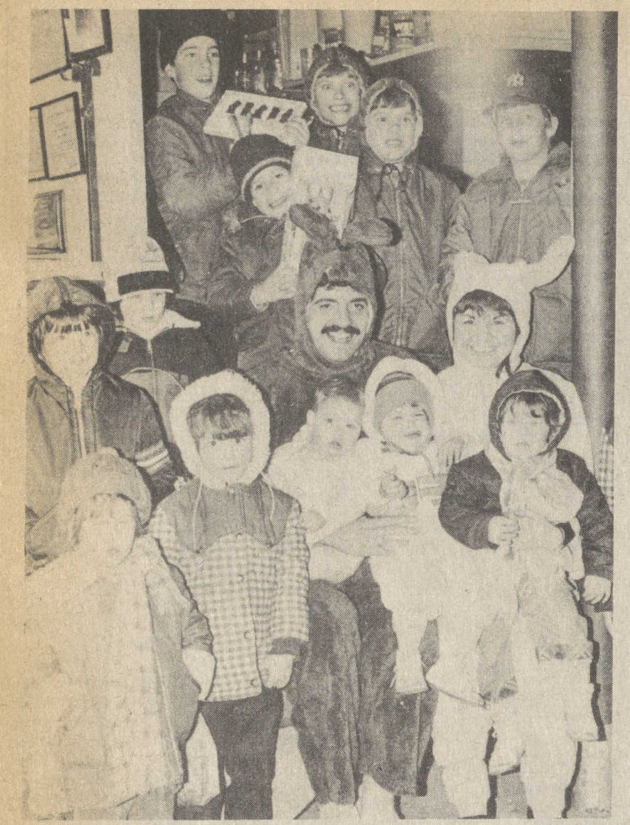
EASTER'S COMING-Mr. and Mrs. Rabbit knew Easter was just around the corner when they were besieged by children at the Newcomers Club Easter Egg Hunt at Beaumont last Saturday.

Showing at the 109th ARTILLERY ARMORY Kingston, Pa.