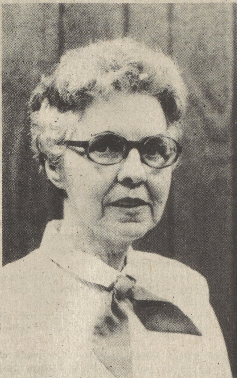
Incumbent Purcell GOP

There are two odd things about this year's Harveys Lake Borough Council primary race.