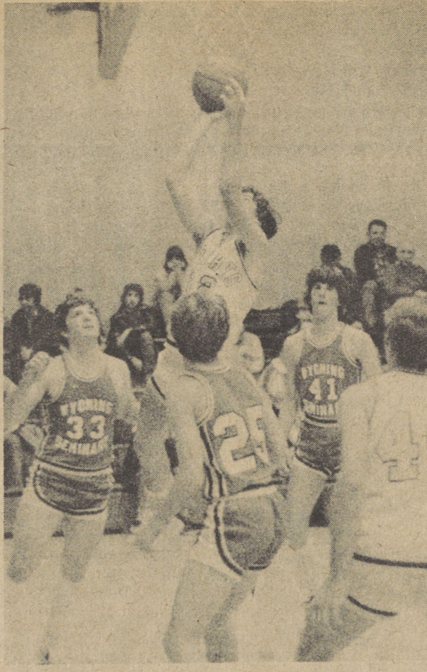
SHOOTING FOR A STAR-A Lake-Lehman Knight shoots for a basket not a star in the Knights contest with Wyoming Seminary at the Kingston gym last week. The Knights edged Seminary 68-63 for their first win in Seminary's gym.

The Sunblazers open the 1979 campaign when they play host to the University of Tampa on Friday, Feb. 16.