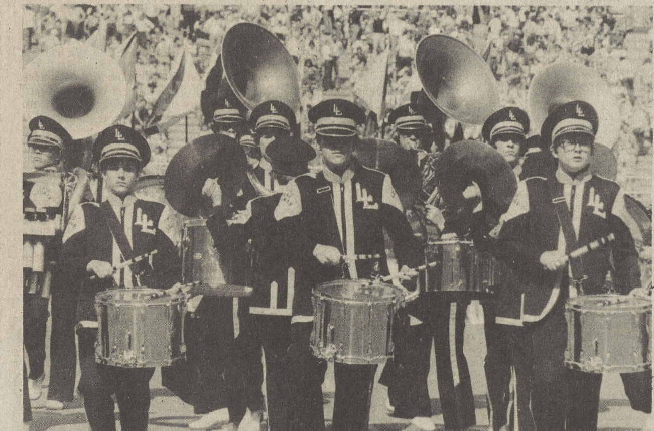
DRUMS, CYMBALS, BRASS -Drums, cymbals and brass sections of the Lake-Lehman Band drew attention from the stadium-filled crowd Sunday af-