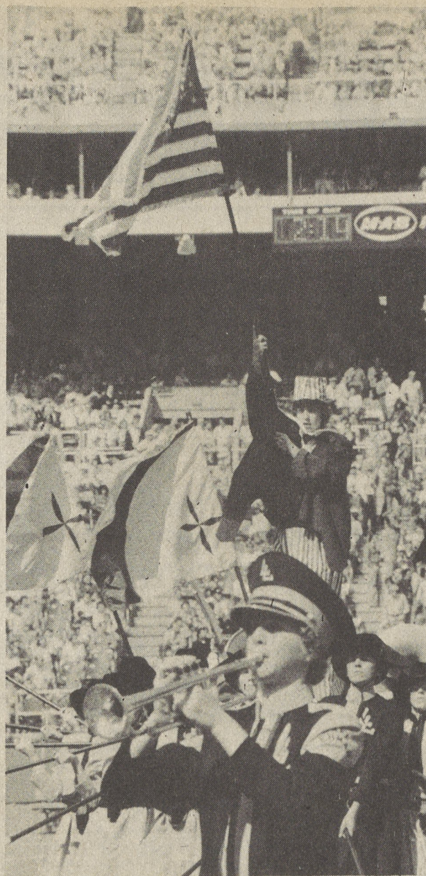
FINALE -Finale of the Lake-Lehman Bands half-time performance drew thunderous applause as the American Flag girl emerged from a circle of the band members while the band played at the Dolphins-Eagles game on Sunday.