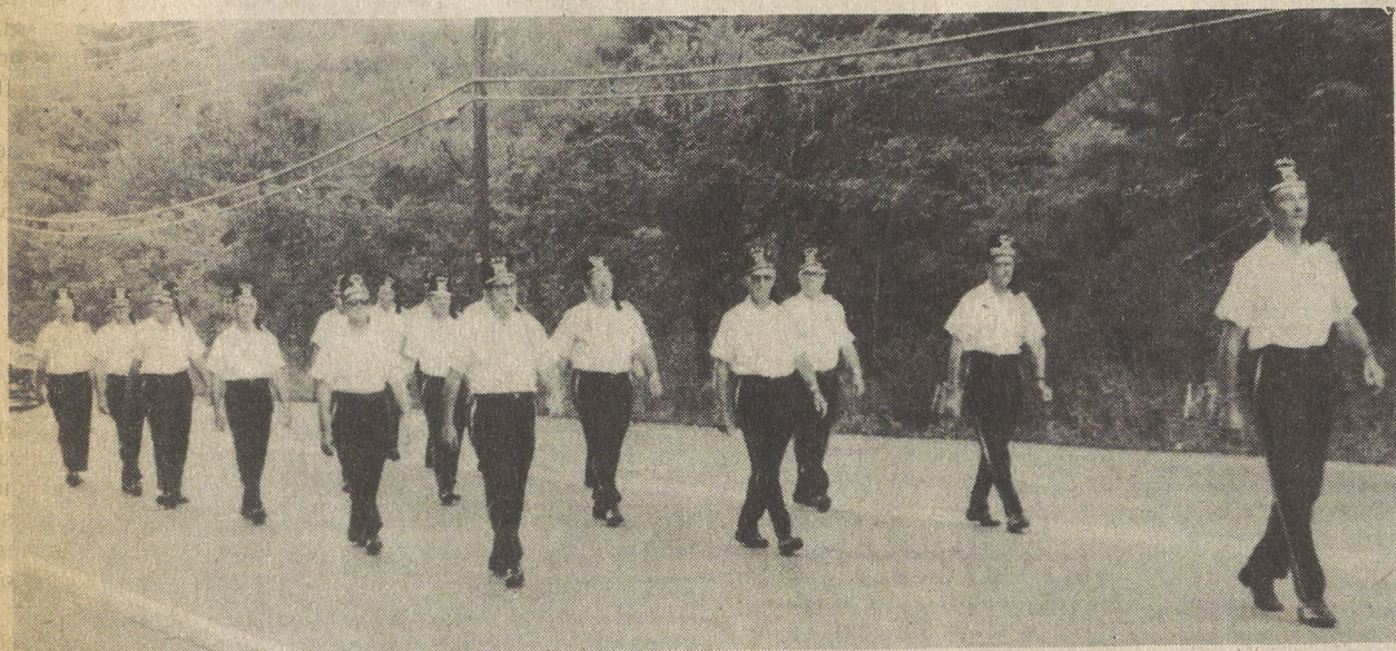
SHRINE UNIT —Several Shrine units marched in the Dallas Fire and Ambulance Country Carnival parade last weekend such as the group above.