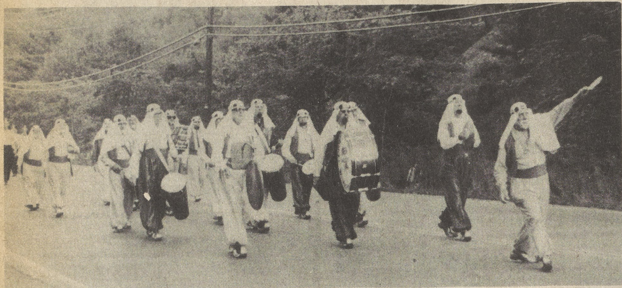
INVASION OF THE BACK MOUNTAIN —Just the Arab Patrol of the Shrine who marched in the Dallas Fire and Ambulance parade last weekend at the start of the Country Carnival.