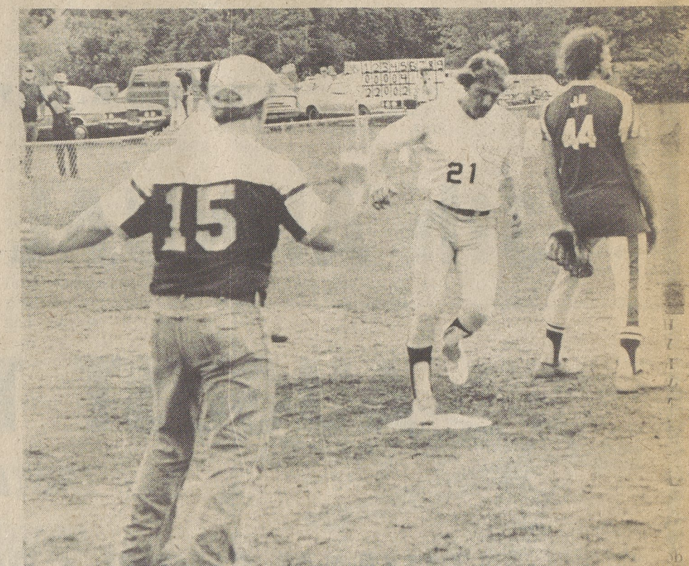
HE SCORED-The Grotto Pizza player got a hit and then with some help made it around the bases to score against the Suds in the Slo-pitch game played at Noxen.

Route 6 Plaza TUNK • 836-5486 Mon. thru Sat. 9:30 AM to 9:00 PM Sun. 10:00 AM to 2:00 PM