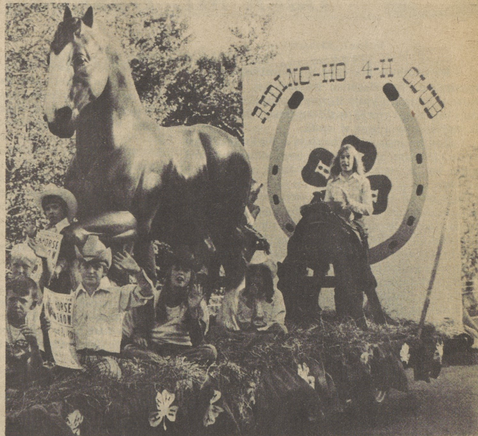
RIDING HO -The Riding-Ho 4-H Club members were tuned in to the spirit of the Lehman Horse Show with their eye-catching float entered in the parade Friday night which marked the opening of the annual event.