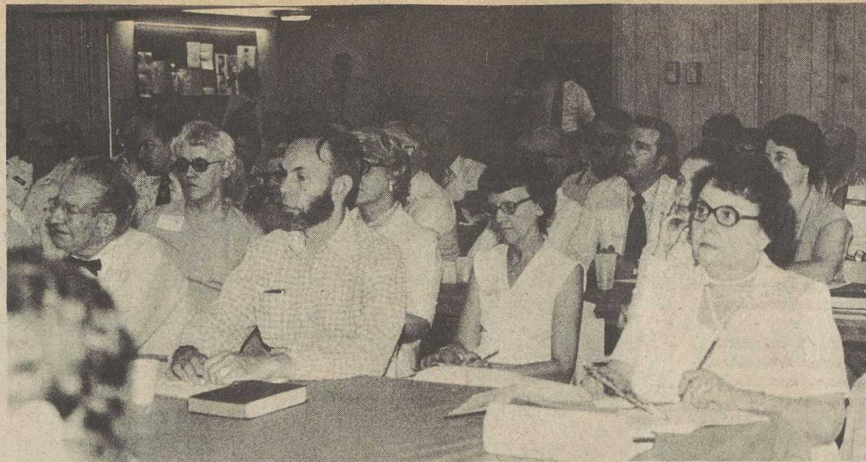
PRESBYTERY -Delegates from Presbyterian Churches of the Lackawanna Presbytery attended the regular meeting hosted by Trinity United Presbyterian Church, Dallas, Tuesday afternoon and

ICING 1/2 stick butter 4 oz. cream cheese, softened 2 t. vanilla 1/2 box confectioners sugar Mix ingredients together until smooth. Spread over cake.