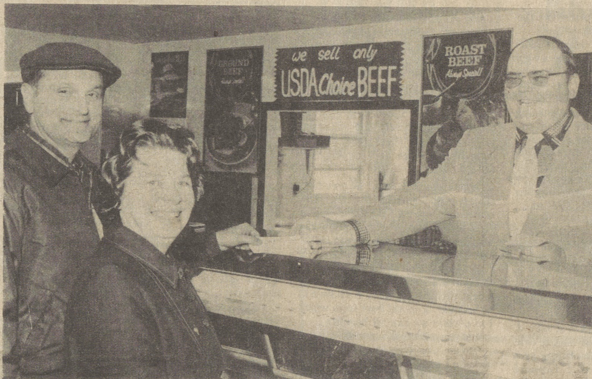
BEEF AWARD -An unusual prize being chanced off this year at the Back Mountain Memorial Library Auction will be a side of beef. The winner may keep the beef in a freezer locker at Country's Best, Dallas, and take the beef as he needs it. Tickets are available at