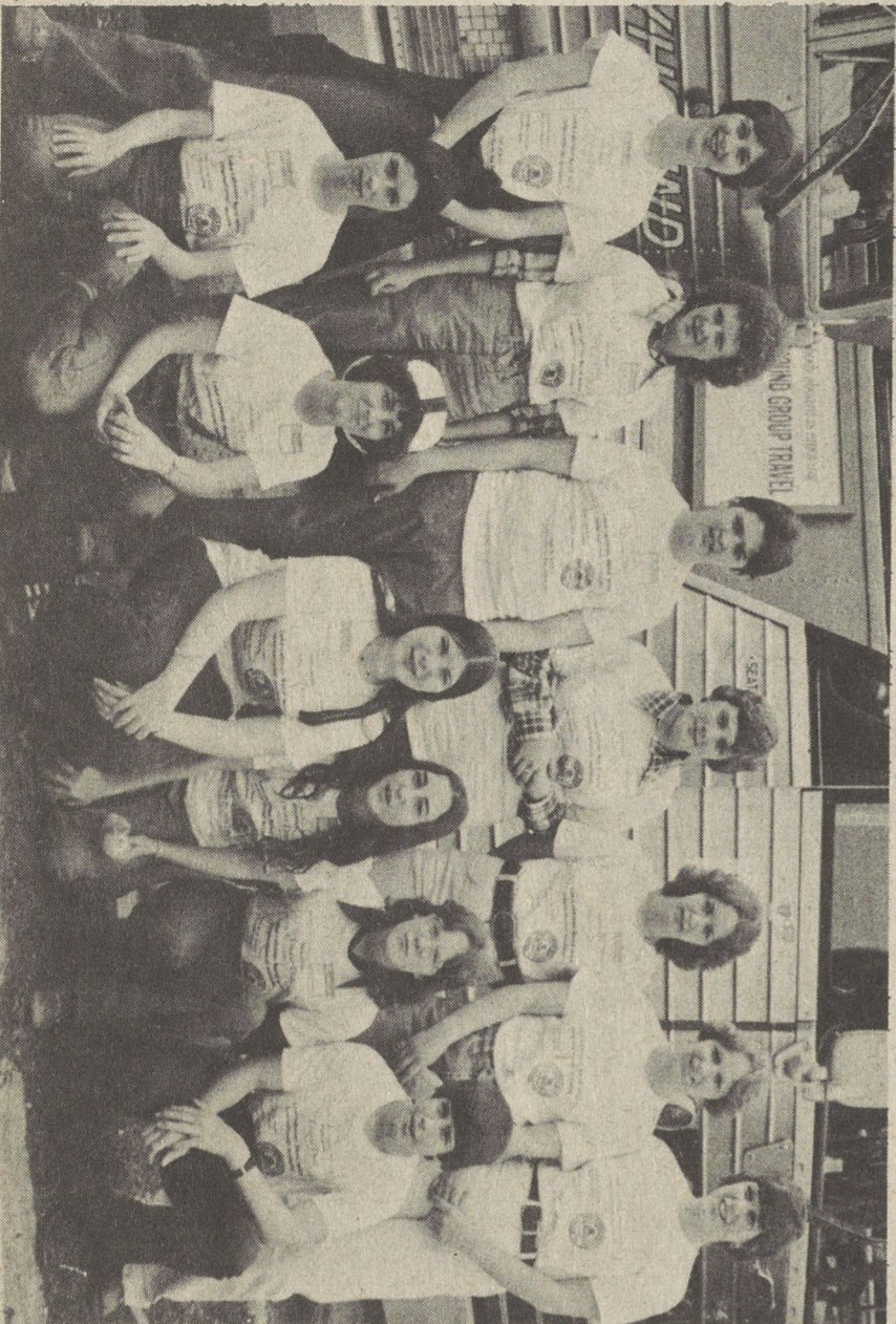
VICTORIOUS AGAIN —A group of Lake-Lehman band members pose outside of the buses at one of their stops on the way home from Virginia to display their gift