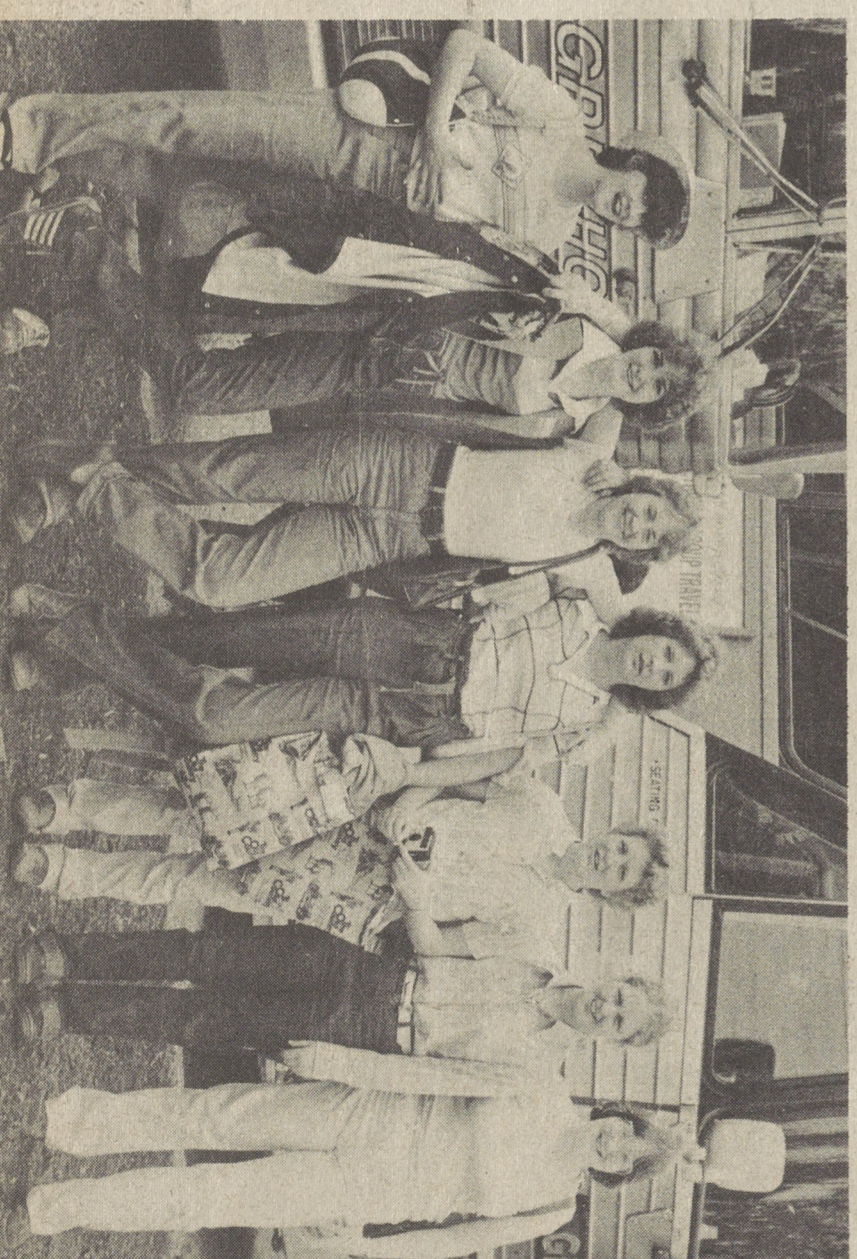
ON OUR WAY —We're on our way to Norfolk, Va. and the Azalea Festival, and another trophy for the band. The band members traveled by Greyhound Bus and stopped along the way for lunch. These girls relax

This section made possible by sponsoring Back Mountain merchants