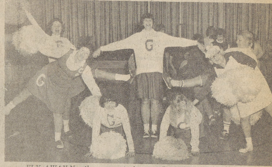
FLY AWAY —No, they are not about to fly away—just Gate of Heaven mothers cheering for dads in recent Gate of Heaven father-son basketball