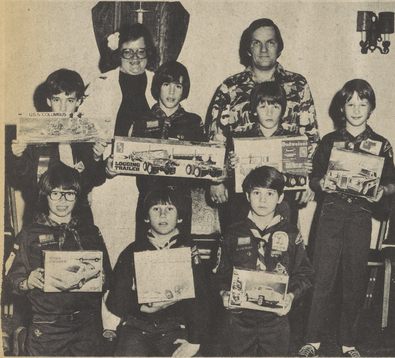
POPCORN AWARDS -Members of Cub Scout Pack 132, who were top salesmen in their recent popcorn sale, received awards at the recent Blue and Gold banquet. Winners and adult volunteers of the Pack are