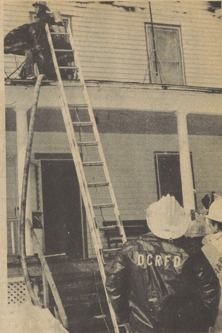
TO THE TOP - Dallas, Idetwon and Harveys Lake Volunteer firemen climbed to the top of the burning building at Harveys Lake last week trying to control the flames but the building was destroyed.