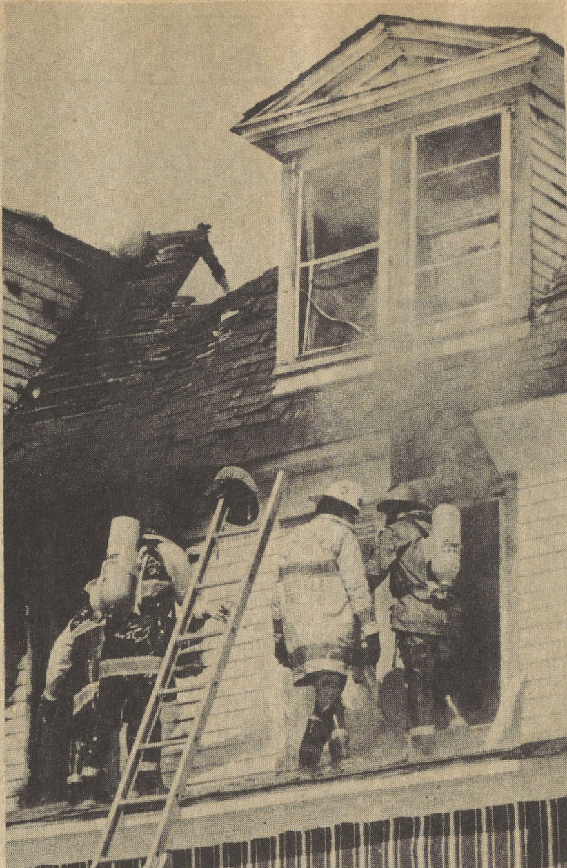
TO THE RESCUE - Neighboring fire companies came to the rescue of the Harveys Lake Fire Company in fighting the Lakeside Hotel property but to no avail as flames destroyed the building.