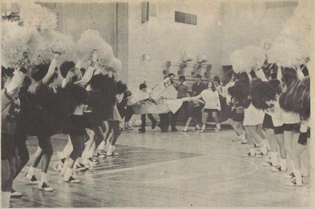
KEEP THE SHOE --Keep the shoe, it's up to you, said Dallas cheerleaders, strutters and majorettes as they cheered the Mountaineers in the pep rally at the senior high school on Friday afternoon.