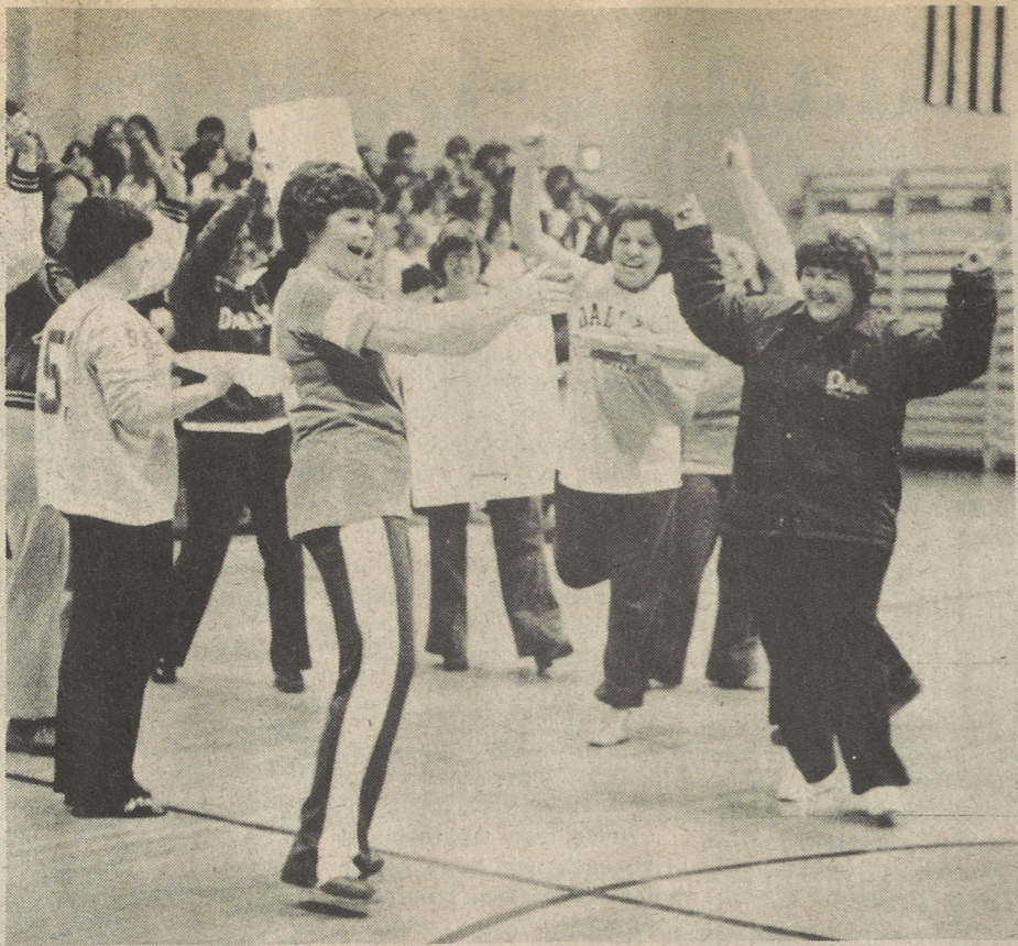
GIVE ME A D --Lake-Lehman football mothers came out on the floor as Dallas cheerleaders during the Knights' pep rally last Thursday giving the Dallas cheer "Give me a D". It didn't last long as members of the team took them off the floor.

Booster members, friends and the public are invited. Plan to attend: