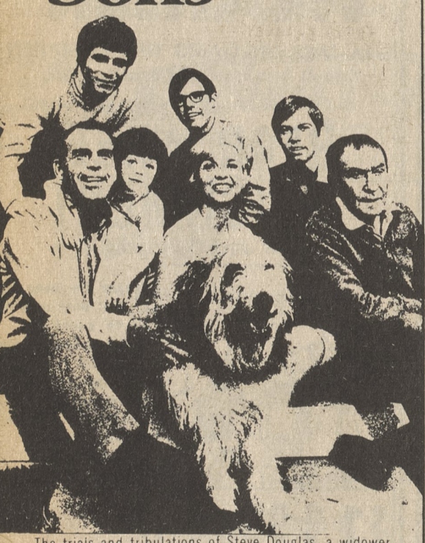
The trials and tribulations of Steve Douglas, a widower, and his sons, Mike, Robbie, and Chip