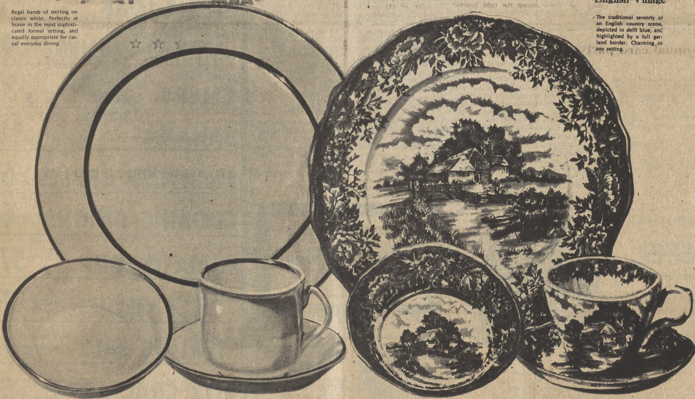
Your choice of these two patterns

The traditional serenity of an English country scene, depicted in delft blue, and highlighted by a full garland border. Charming in any setting.