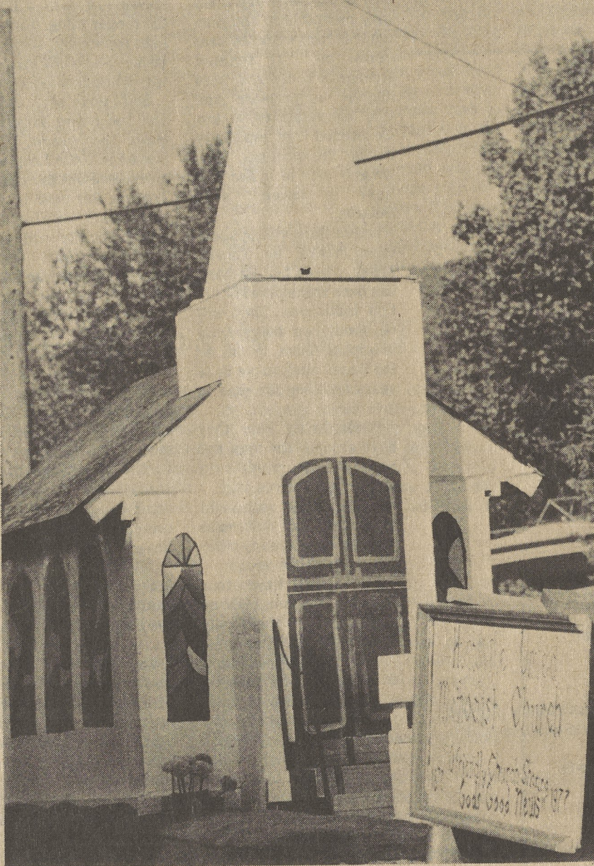
100 YEARS—Jackson Township held a Memorial Day weekend parade and also celebrated the hundredth anniversary of Huntsville United Methodist Church. Above is the float, a miniature of the church, which was entered in the parade.