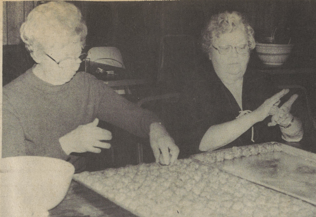
HOMEMADE AND PLENTY--The food served at the Fourth Annual Pollock Night, Saturday, April 23, from 5 to 8 p.m. will be homemade and there will be plenty of it. Members of the auxiliary have been working hard preparing the many Polish dishes as part of the menu.

As previously reported, UGI's earnings for the 12 months ended Dec. 31, 1976, increased 23 percent to $10,688,000, or $2.64 per share. Operating revenues rose 26 percent to $199,221,000.