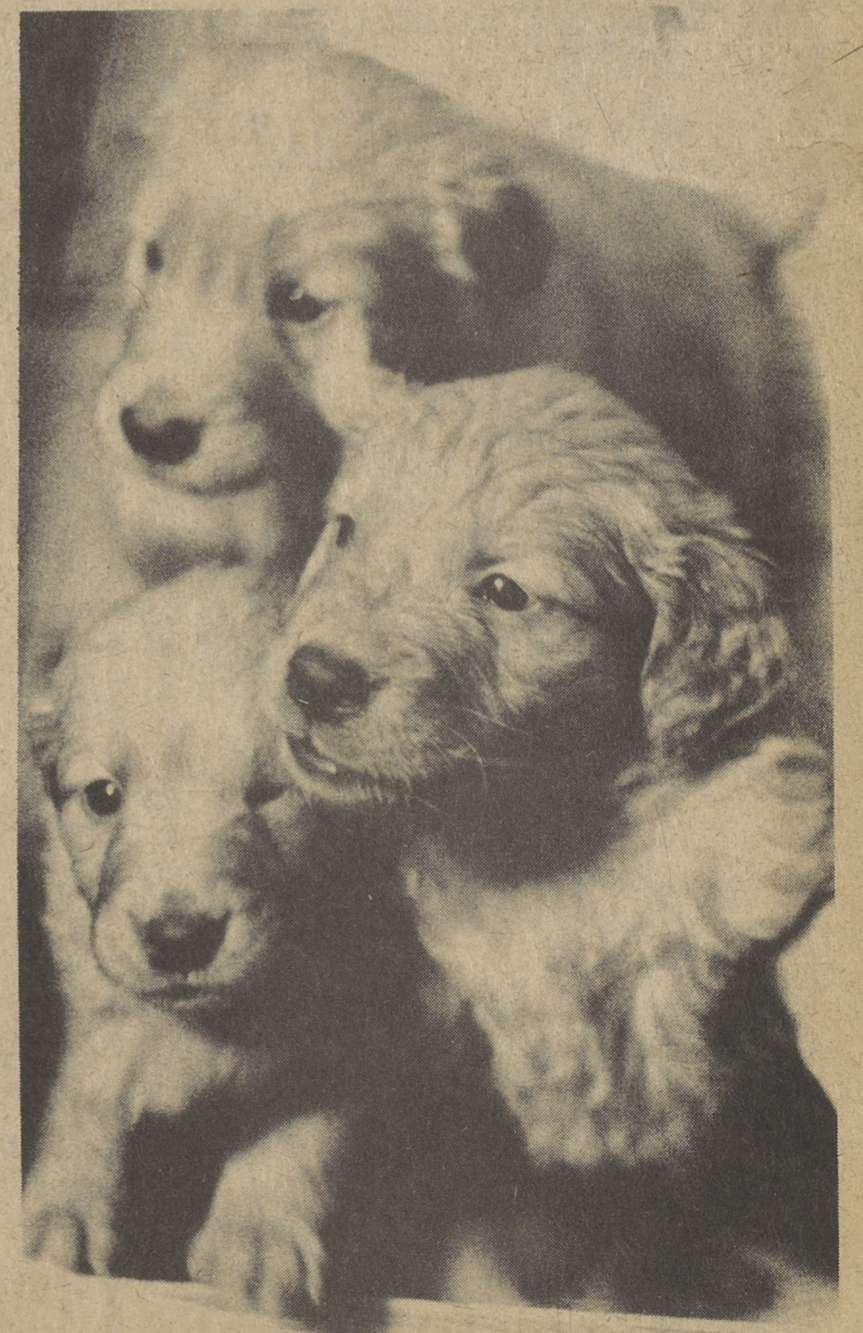
PUPPY LOVE —These AKC registered golden retriever puppies are looking for someone to love. One of them can be yours. See more on classified page.