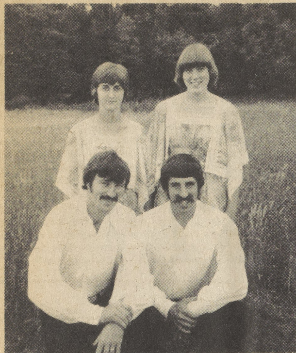
TO APPEAR IN CONCERT—"The Gospel Truth," a group from Sweet Valley, will bring their evangelistic ministry to Emmanuel Assembly of God Church, Harveys Lake, on Friday, Dec. 31. The concert will begin at 10 p.m.