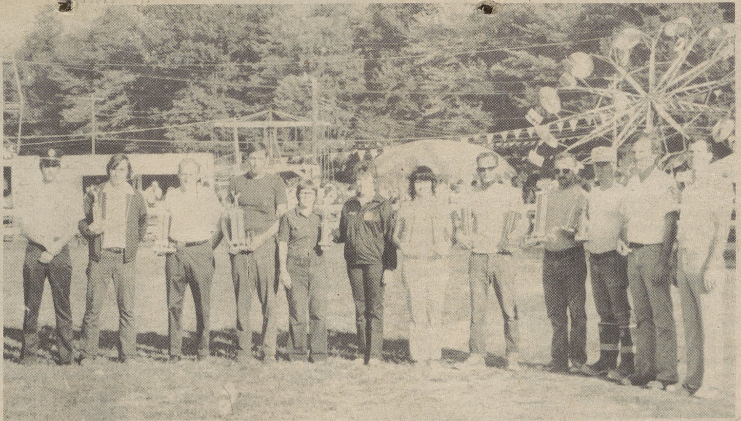
AWARD WINNERS--The above lineup took home the awards during last year's Firemen's Olympics on Sunday at the fair. The events will be repeated this year in a revised format.