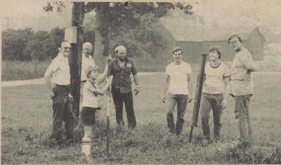
FENCING--Members of Back Mountain service clubs and Boy Scout troops were on hand to assist the installation of a fence for the fairgrounds.