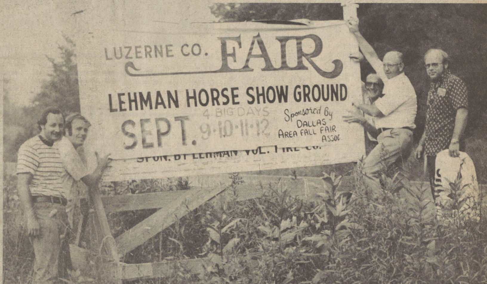
FAIR DAYS--Fall Fair workers turned out to put up the big poster on the Lehman Horse Show Ground announcing