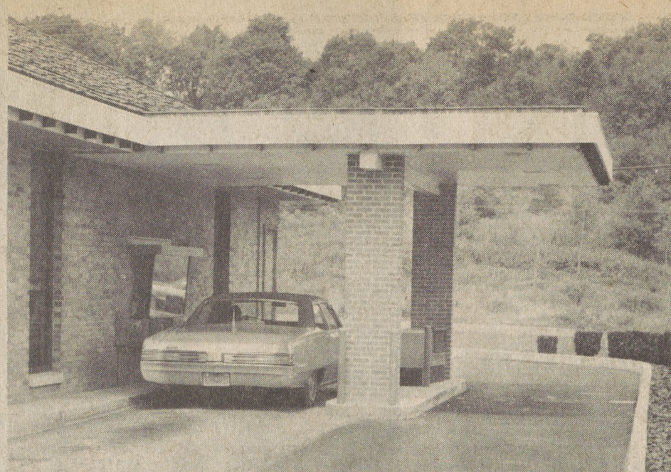
AUTO-TELLER —A newly-installed "Auto-Teller" has doubled the drive-in service capabilities at the Dallas Office of First Eastern Bank. The new system is located alongside the regular drive-in lane and allows motorists to conduct banking business with tellers inside the office. Also, a two-way system of communications allows motorists and bank personnel to communicate with one another.