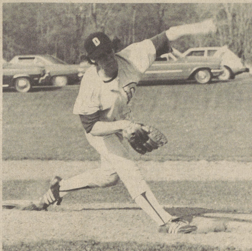
HE'S OUT—Skammer's striking out the man at the plate in Monday's game with Crestwood but he's not striking out Supulski.

Reese fanned eight and Skammer three for 11 strikeouts for the Mounts.