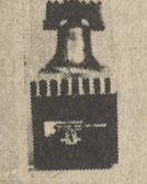
LIBERTY BELL BANK