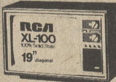
SECOND GRAND PRIZE RCA XL-100 19" Color TV