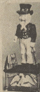
UNCLE SAM BANK