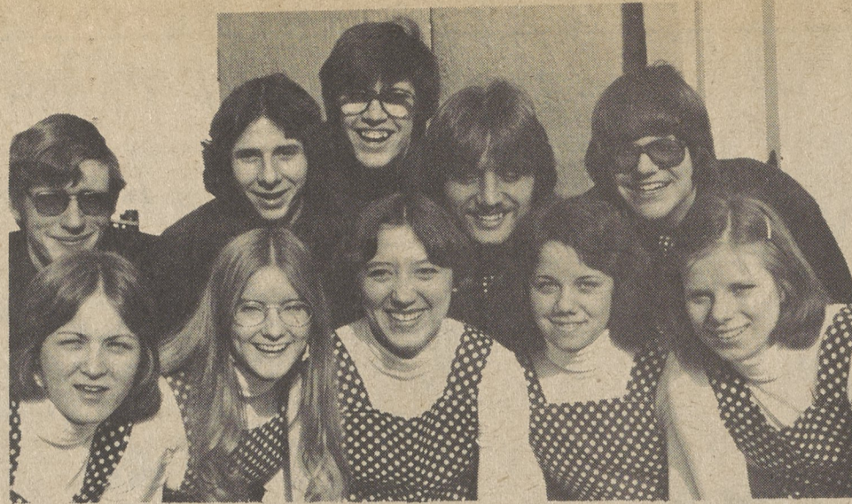
All Gods Children