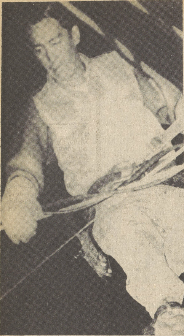
STAR OF THE GAME —Penlee employee repairs transformer that literally knocked the lights out at Friday's Lake-Lehman-Wyalusing football game at the Wyalusing Stadium. At right is the burning pole that did the damage.