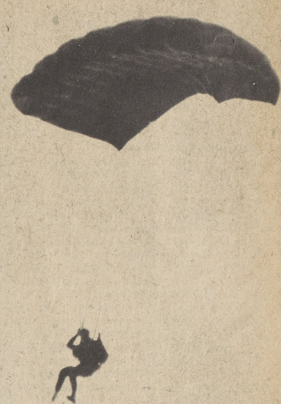
WHAT IS IT —Handicapped sky diver floats in the air over the Luzerne County Fair Saturday.

A reception sponsored by the Wilkes-Barre