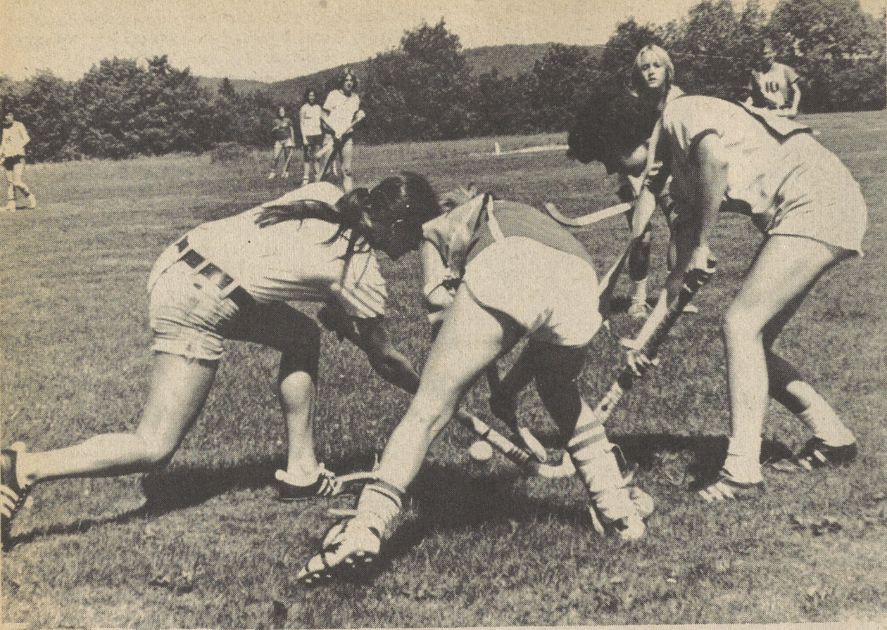
HOCKEY ACTION-Some of the action at last week's Ruby Carmon's Sports Camp