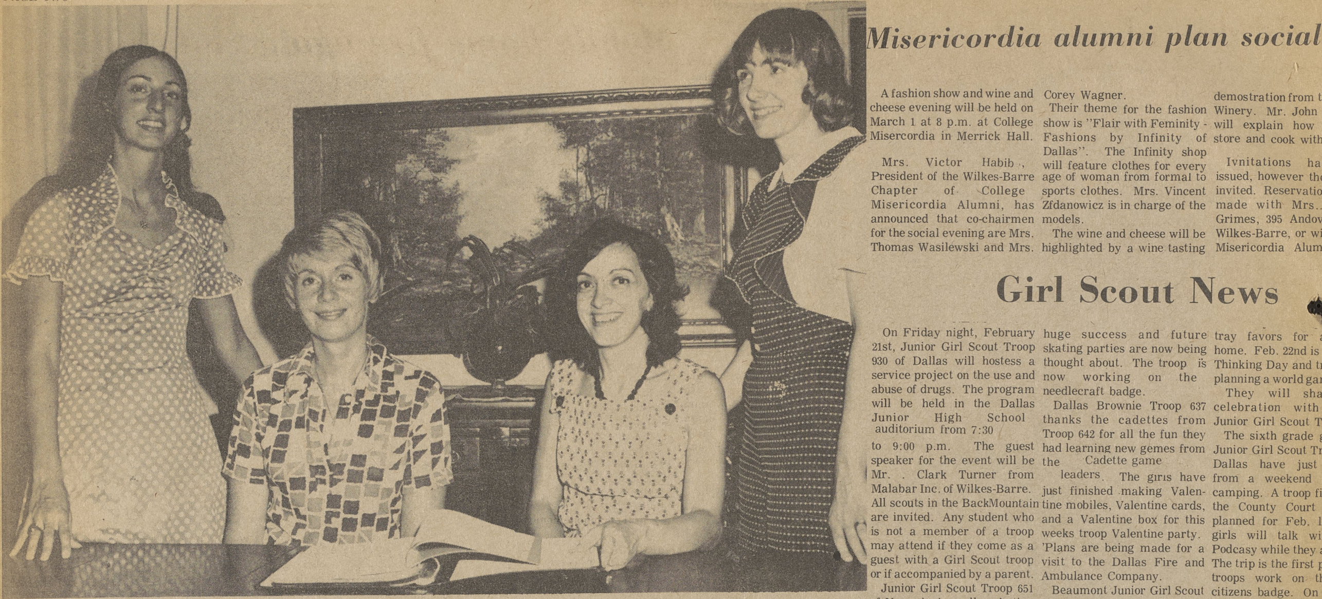
PLAN SOCIAL -- Members of the College Misercordia alumnae plan fashion show and wine and cheese evening to be held March 1 at Merrick Hall.