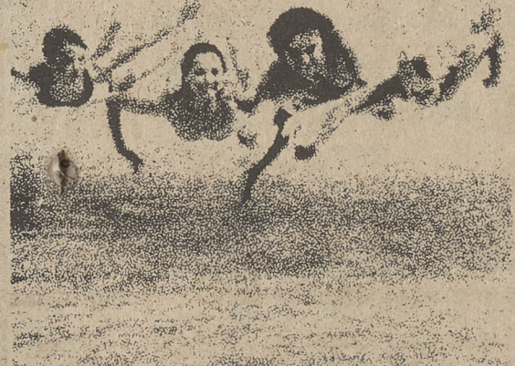
HTH... The Beautiful Water Control

Family Reunions & Outings Phone 639-1015 or 639-1642 Restaurant Open 7 a.m. - 11:30 p.m. Closed All Day Tuesday Merchandise Games Nightly