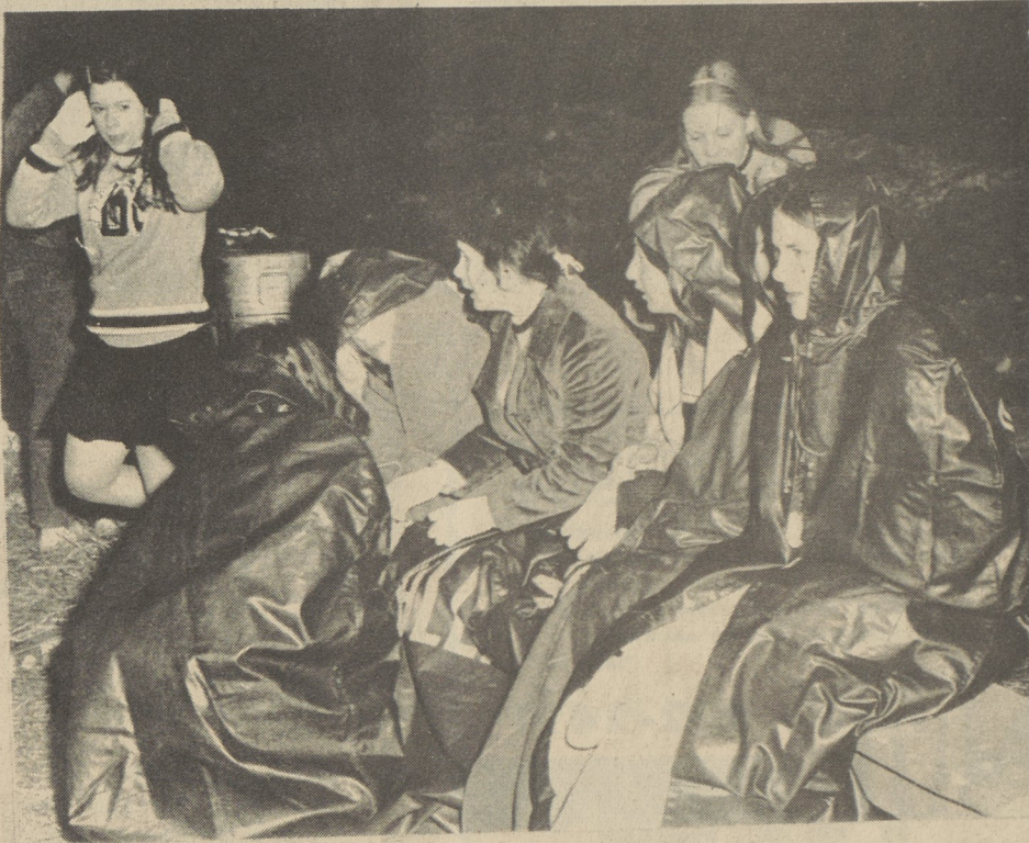
It was a cold, cold night and the cheerleaders found interludes between cheers almost unbearable.