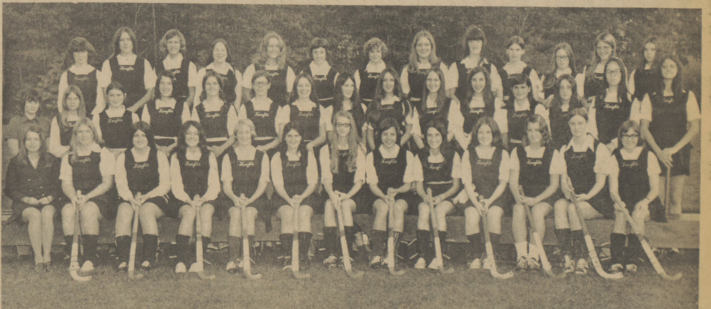
Lake-Lehman High School's hockey team will host the Abington Heights High School girls Thursday.