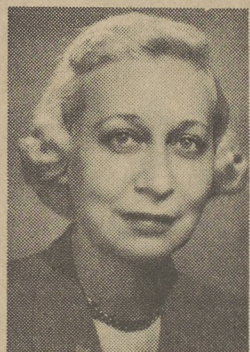
LUZERNE COUNTY COMMISSIONER ETHEL A. PRICE