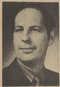
LUZERNE COUNTY SHERIFF JOSEPH MOCK