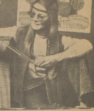
GETTING IT TOGETHER can be great fun. Important accessories include shades, by Foster Grant.

The Cooperative Extension Pennsylvania Retailers