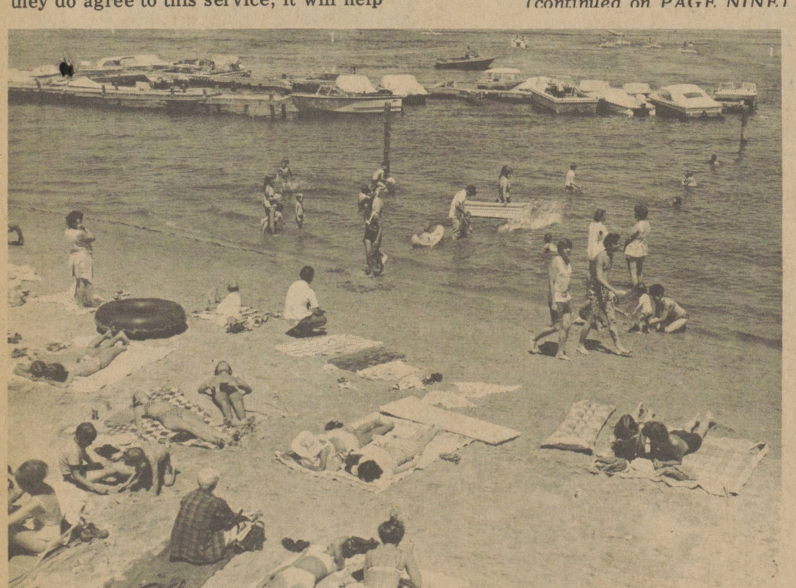
The Dallas Post