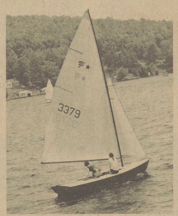
A graceful sailboat glides across Harveys Lake Monday afternoon, a participant in the yacht club's

Hear Ye! Hear Ye! The 25th Annual Back Mountain Memorial Auction will open tomorrow afternoon at 1 p.m. The three-day affair will include a children's auction Saturday morning, continuous action on the auction block until the wee hours Friday and Saturday nights.