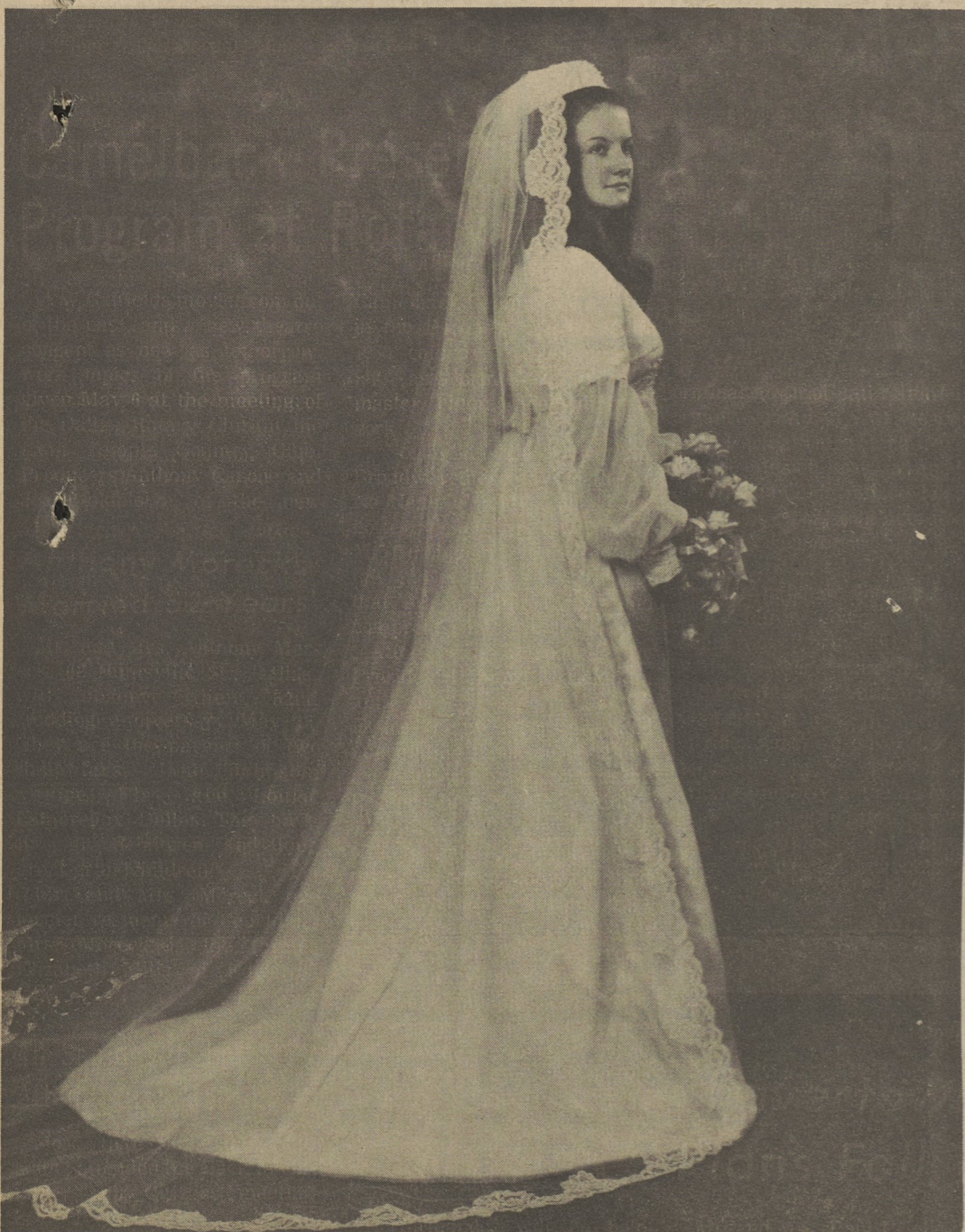
The Dallas Post